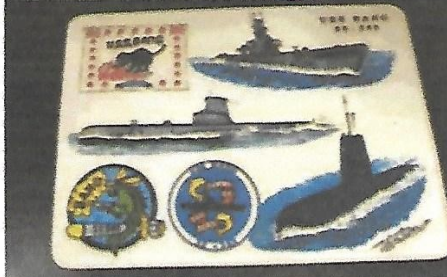
Bang Trilogy Mouse Pad $12,00